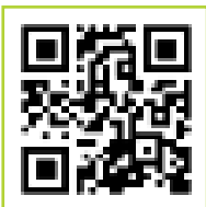
Scan the QR code

For further details please contact our local sales representatives. We would be happy to assist you to make sure you get the best possible performance of the InfoAir system.