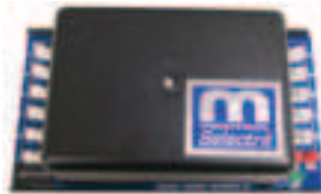
Figure 1. Replacement Maxitrol Amplifier